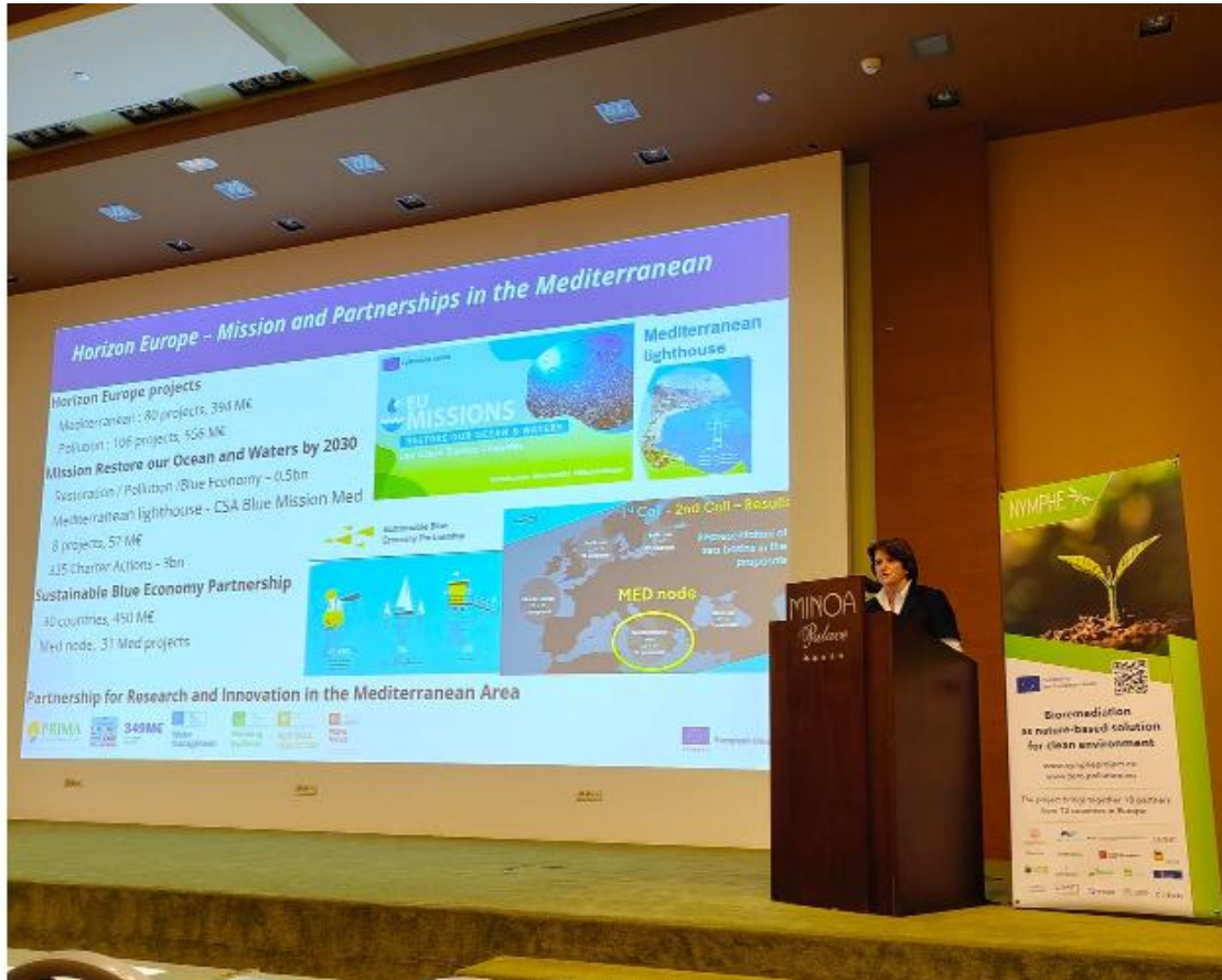
Watch the recording: ALL4BIOREM Workshop EBC-IX